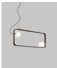
GROOV SP 90