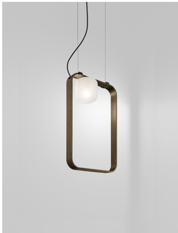
GROOV SP 60 BCSF BR2 E14 CE